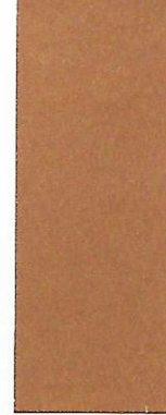
Metallic Copper TSR 49%