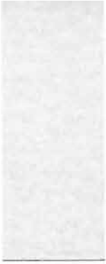
Galvalume TSR 25%