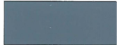
Hawaiian Blue TSR 31%