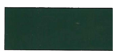
Forest Green TSR 28%