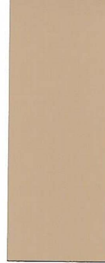
Mocha Tan TSR 47%